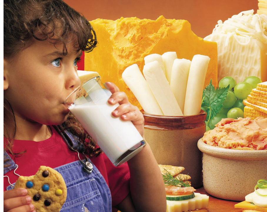
Sanitary Design Integrity You Can Trust